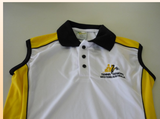
LADIES SHIRT– SLEEVELESS AVAILABLE WITH SHORT SLEEVES

Discounts available if we have your shirt size in stock. First in, Best Dressed.